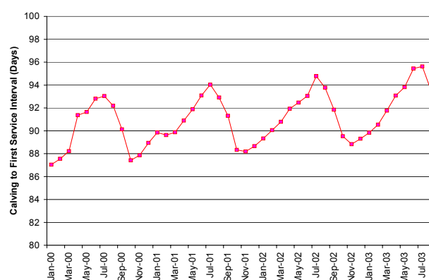
Figure 2. Monthly phenotypic trend for interval from calving to first service (CTFS) across all parities in Canadian Holsteins.

Similarly, Figure 2 shows the monthly trend for CTFS across all parities. Of interest for CTFS is the consistent seasonal trend with the shortest intervals being associated with first inseminations in November and the longest occurring in July of each year.